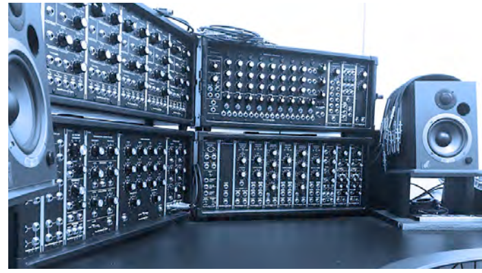
The analogue synthesizer in the M.A.S.T. music technology lab