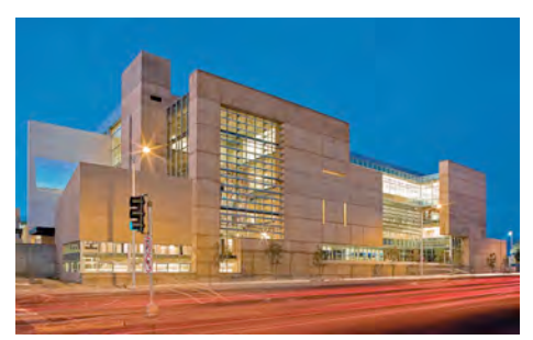
George Pearl Hall houses UNM's Fine Arts Library

The University of Mexico has a beautiful, architecturally unique campus and at the center of it all is a large and busy music department with over 50 faculty (30 full-time) and approximately 350 students filling orchestras, wind symphonies, choruses and an opera program. And of course there is lots of contemporary music.