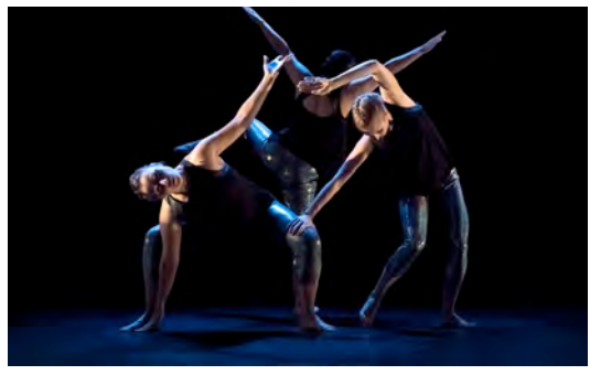
The Shift Dance Festival happens every fall in ABQ

Albuquerque is a wonderful place to live, full of sights and so deeply in love with New Mexico!