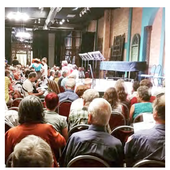
A crowd getting ready for a Chatter concert at Las Puertas