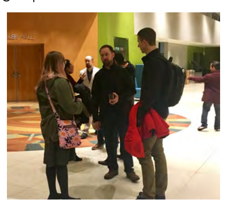
UNM students and alums mixing with composers from all across the country at the 2019 SCI National Conference

Many recent UNM Theory and Composition graduates have gone on to do graduate and doctoral work in