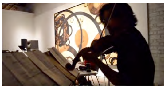
NMCE at the Center for Contemporary Art (Santa Fe)

sounds and above all wonderful, hard-working, laid-back people who value individuality and creativity. Come find out why so many people fall