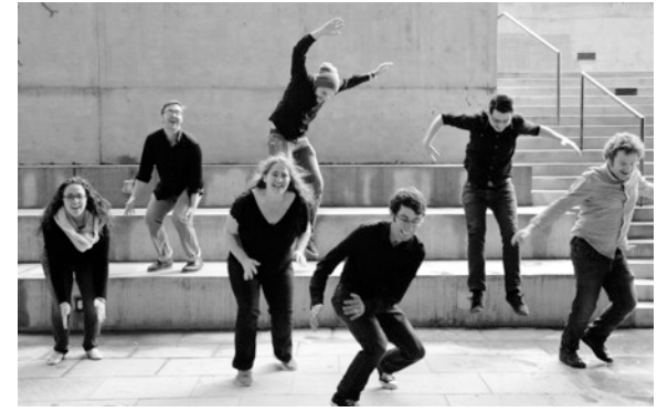
NMNM performs adventurous rep and student works

New Music New Mexico (NMNM) is a group made up of graduate and outstanding undergraduate players who play challenging repertoire and