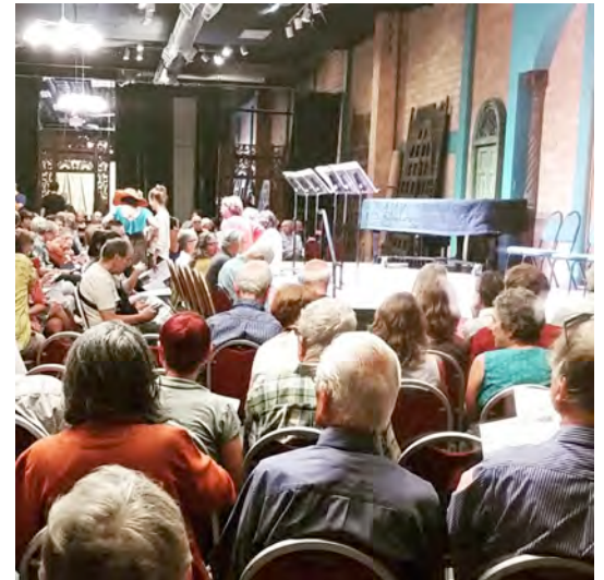
A crowd getting ready for a Chatter concert at Las Puertas