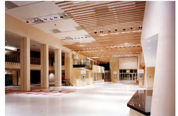
The lobby of the UNM Center for the Arts

The technology lab has new iMacs at workstations with cool new desks that height adjust to allow for standing-desk work. There is a new Moog replica that matches the original Moog we have on campus. It is normal for the Moog to be burbling out some analogue craziness making the lab a fun and lively space.