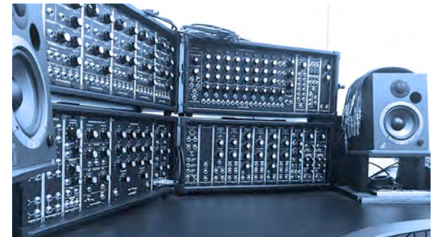
The analogue synthesizer in the M.A.S.T. music technology lab