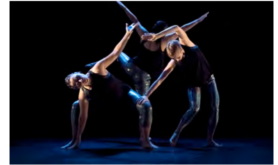
The Shift Dance Festival happens every fall in ABQ

Albuquerque is a wonderful place to live, full of sights and sounds and above all wonderful, laid-back but hard-working people who value individuality and creativity. Come find out why so many people fall deeply in love with New Mexico!