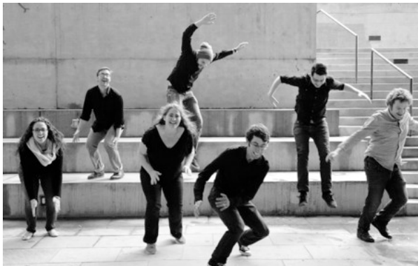
NMNM performs adventurous rep and student works every term

every Friday to work on collective projects, share ideas, improvise together or visit with guest composers or performers. They also present their work to each other at the end of each term in a large group feedback session. With a large, diverse composition faculty, students have a broad choice in teacher and can rotate studios each year to get fresh perspectives on their music.